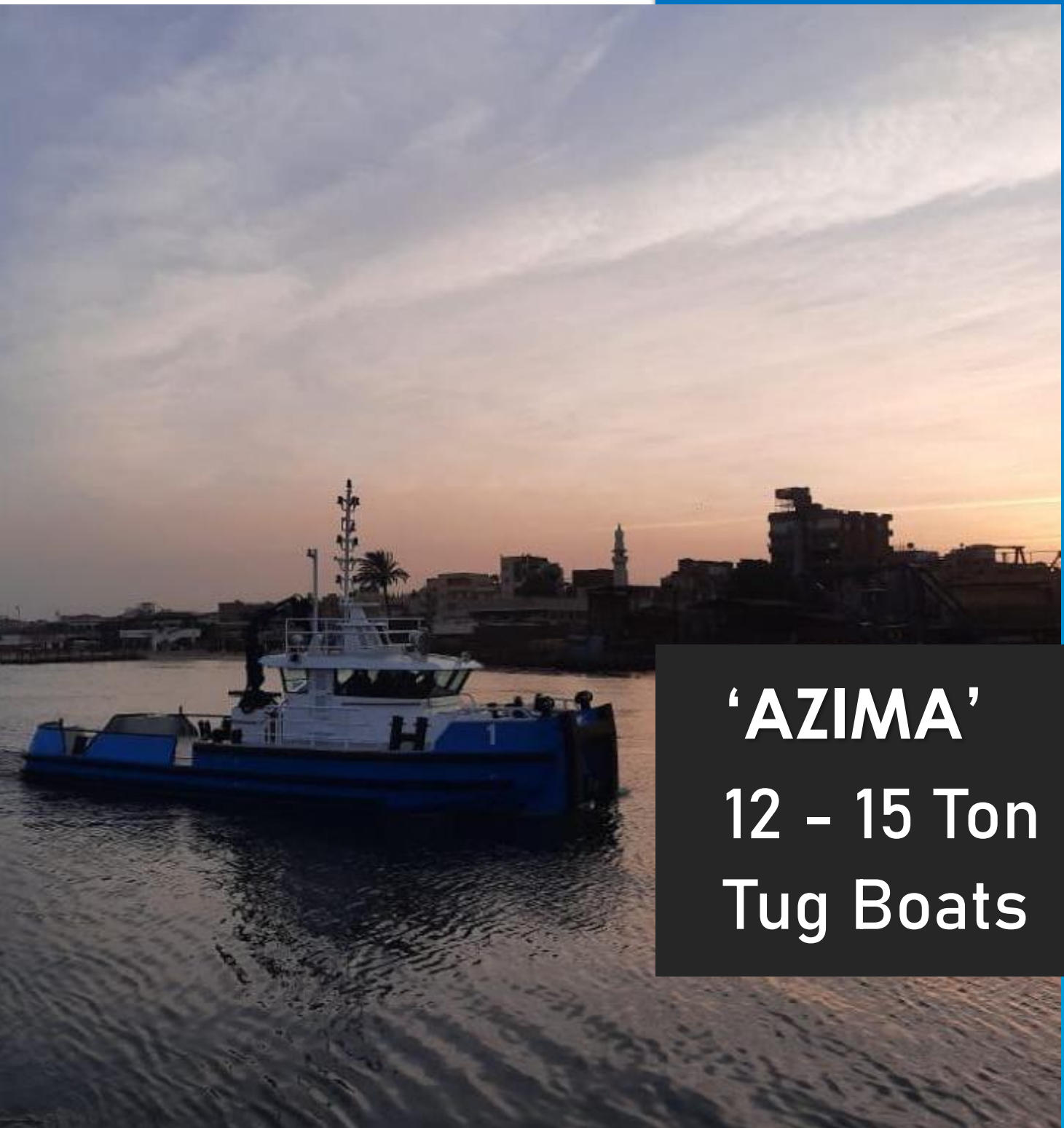
‘AZIMA’ 12 - 15 Ton BP Tug Boats